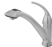
Kitchen Faucet Vella S-2610 Symmons