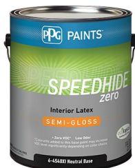
Semi Gloss Paint 6-4510XI Series SPEEDHIDE zero