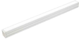
Undercabinet LED Fixture Light Bar MaxLite