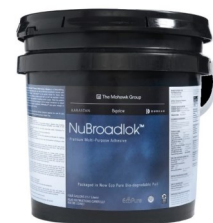
Carpet Pad Adhesive NuBroadlok Mohawk