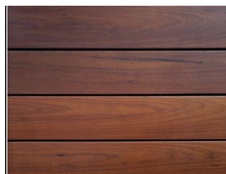
Millwork Lumber Tabebuia Solid Wood N/FD Sterritt Lumber Company