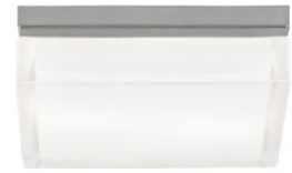
LED Ceiling Fixture Boxie Ceiling Tech Lighting