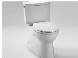
High Efficiency Toilet Vespin II 1G TOTO