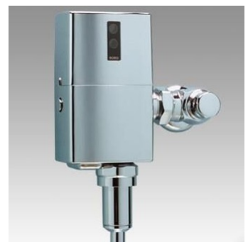
Toto EcoPower Flush Valve (1.28 gallons per flush)