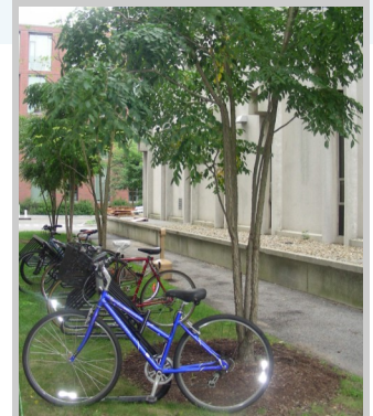
Bike Racks located between 58 and 60 Oxford Street