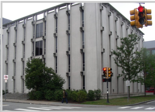
Engineering and Science Laboratory Building 58 Oxford Street Cambridge, MA