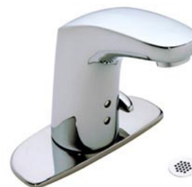
Symmons Ultra-Sense Metering Faucet (with 0.5 gallon per minute aerator)