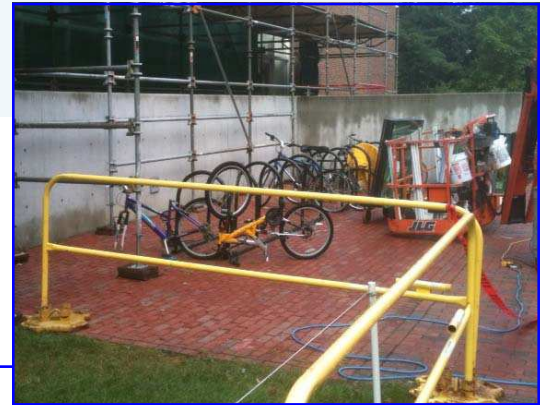
Bike Racks at Oxford Street Entrance