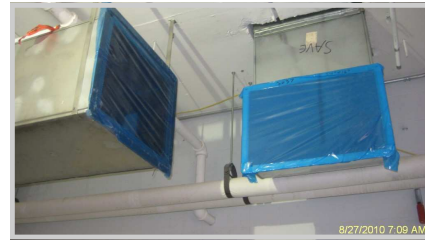
The contractor sealed all supply and return air openings with plastic during demolition and construction. All new duct work was also sealed prior to installation.