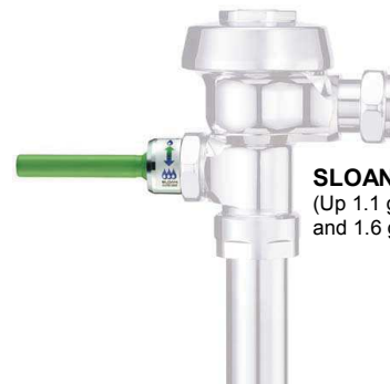
SLOAN Dual Flush Handle (Up 1.1 gallons for half flush and 1.6 gallons for full flush)

Overall, these fixtures reduce domestic water consumption by 32% over standard EPA 1992 fixtures.