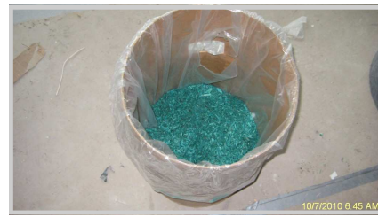
Cleaning procedures were instituted to control contaminants in building spaces during construction and prior to occupancy. This was implemented by using wetting agents and sweeping compounds to control, minimize and suppress dust.