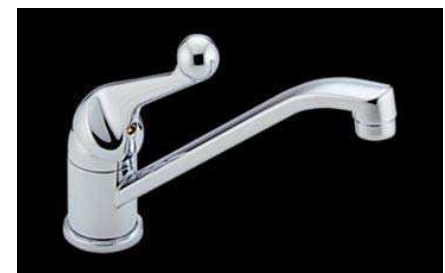
Delta Classic Single Handle Faucet (with 1.5 gallon per minute aerator)