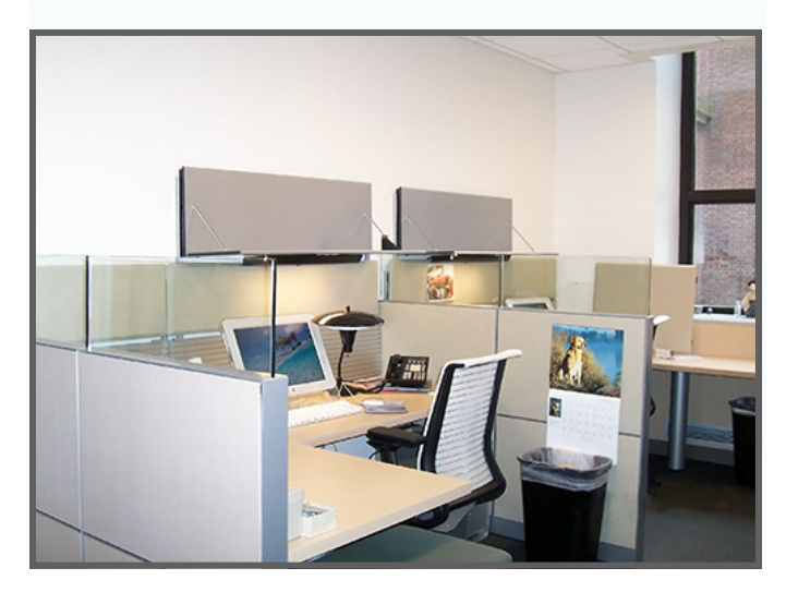
Task Lights at each desk in the Admin Office

Light Sensors The two offices and the area above the student workstations have occupancy and daylight sensors that turn ceiling fixtures on and off based on the presence of people and the levels of natural light, respectively.