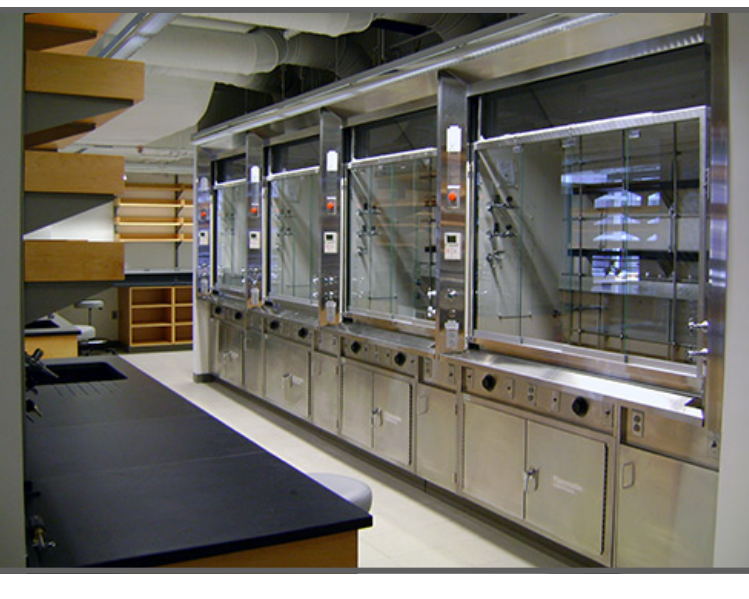
Schreiber Lab 2009