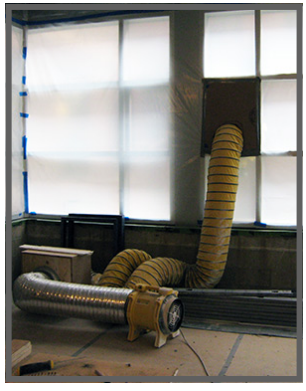
HVAC Protection: Duct equipment sealed with filter