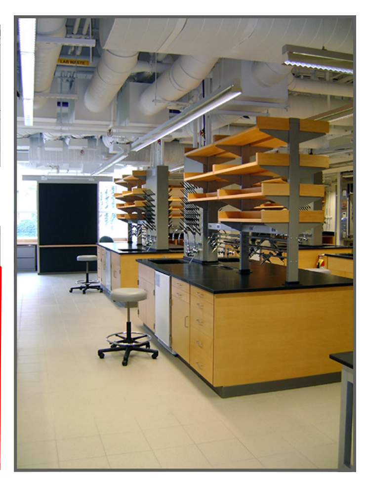
Schreiber Lab 2009