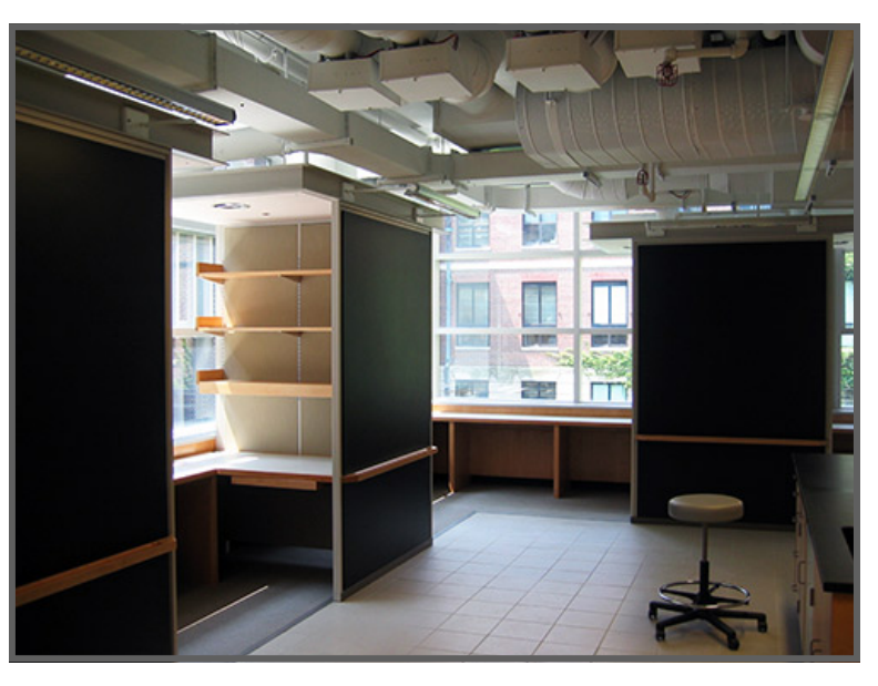
Schreiber Lab Photo: Ellenzweig. 2009