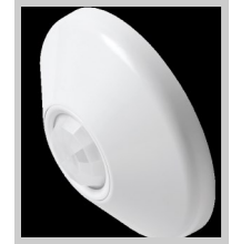
Extended Range 360 Sensor SensorSwitch