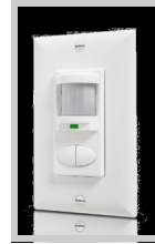
Wall Switch Decorator Sensor