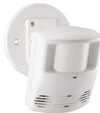
Occupancy Sensor Watt Stopper Model DT-200