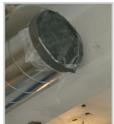
Housekeeping: Ductwork kept sealed after installation