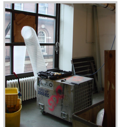
Pathway Interruption: Exhaust filtered and direct to outside