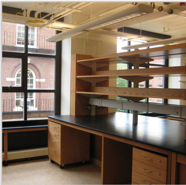
Mango Lab