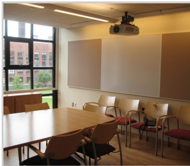
Mango Lab Renovation