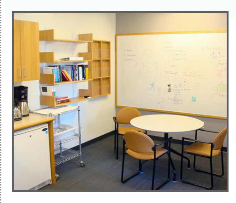
DePace Lab kitchenette Photo: Harvard Office for Sustainability, 2008