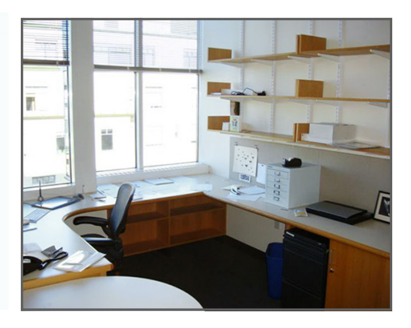
Reused office furniture and low-emitting carpet with recycled content

31% of the project furniture and furnishings were salvaged, refurbished, or reused.