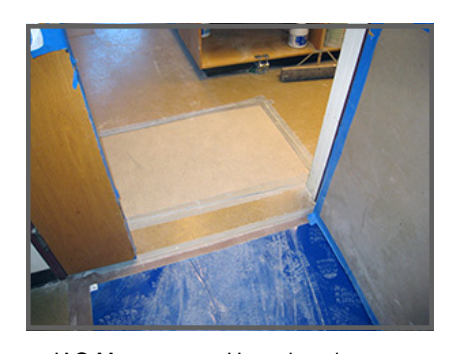
IAQ Management Housekeeping: Walk-off mats at entrance