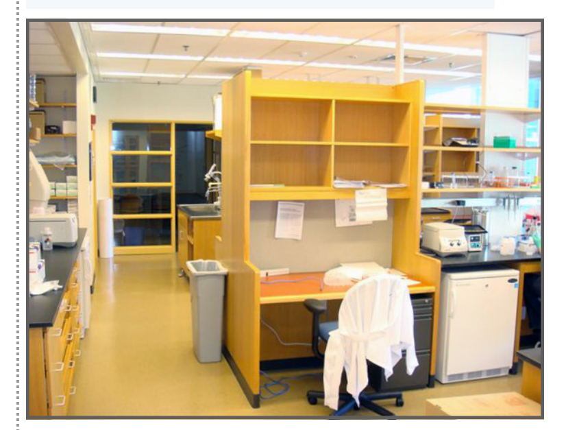
DePace Lab Photo: Harvard Office for Sustainability. 2008

Renovations to the laboratory facility included selective demolition, GWB systems, epoxy floor patching, ceiling patching, millwork, epoxy counter tops, and finishes. The mechanical, plumbing, fire protection, fire alarm and electrical systems were reused from the existing facility.