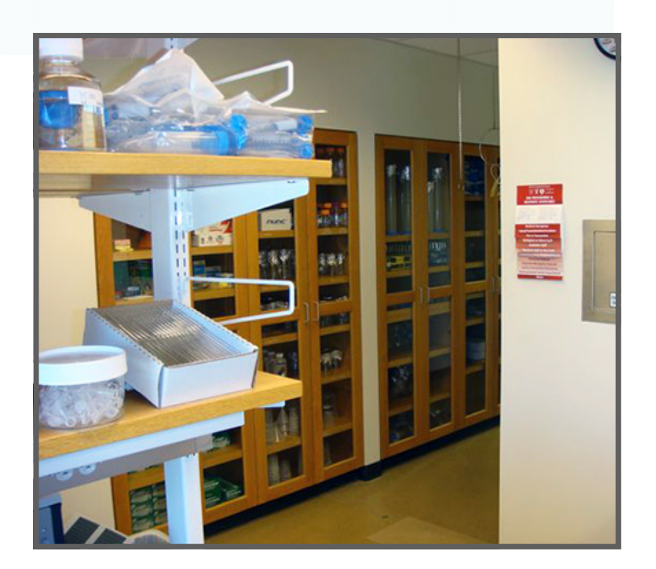
DePace Lab Photo: Harvard Office for Sustainability, 2008