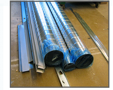
<u>IAQ Management</u> HVAC Protection: Ductwork kept sealed before installation

Lighting Control: 100% of DePace Lab occupants can utilize wall switches to control overhead lighting, while the office space is also provided with task lighting.